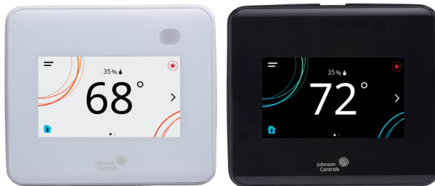
Figure 1: TEC3000 Color Series Thermostat with and without occupancy sensor in white and black enclosures

To provide efficient space temperature control, you can monitor and program the wireless and field-selectable BACnet MS/TP or N2 networked thermostats remotely through the building automation system. The wireless thermostats feature a connection to the ZFR Pro Series Wireless Field Bus Systems. All models include a USB port configuration, with which you can perform simple backup and restore actions from a USB drive. This feature reduces installation time and facilitates rapid cloning of configurations between like units. The programming memory of all TEC3000 Series Thermostats is non-volatile.